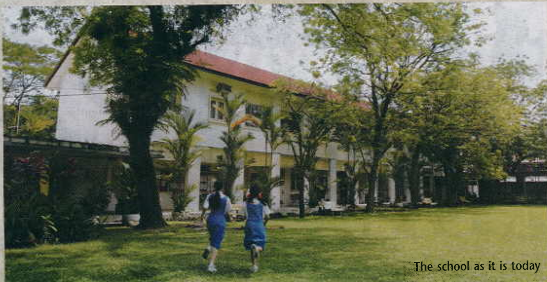
The school as it is today